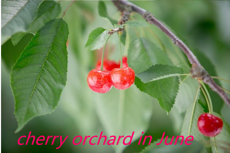
cherry orchard in June